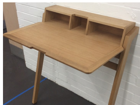
Desk converting to console table, Timothy Summers