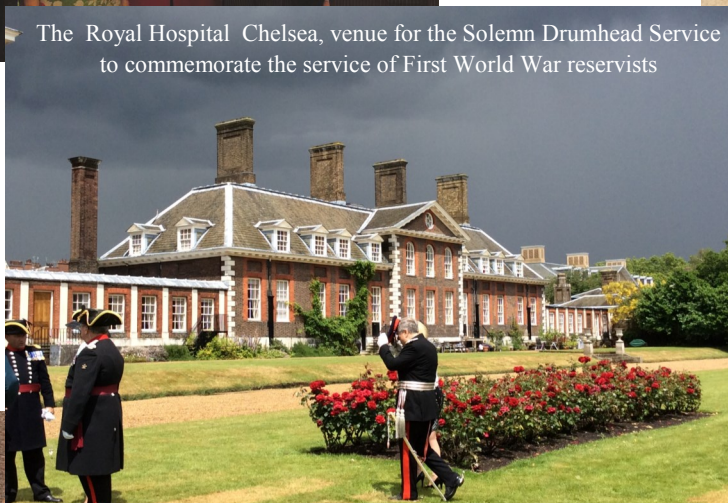
The Royal Hospital Chelsea, venue for the Solemn Drumhead Service to commemorate the service of First World War reservists