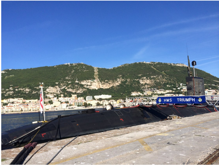
HMS Triumph enjoying the sun in Gibraltar

Firstly a warm hello from myself and the Ship's Company of HMS Triumph. Since the last edition of the Upbraid newsletter HMS Triumph has completed several operations of national importance and the Submarine Command Course to assess future submarine Captains. The Ship's Company have been kept at the top of their game through complex manoeuvres whilst keeping a submarine as old as I am at sea!