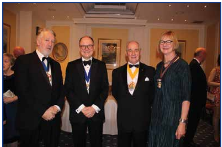
The Worshipful Livery Company of Wales – November 2019