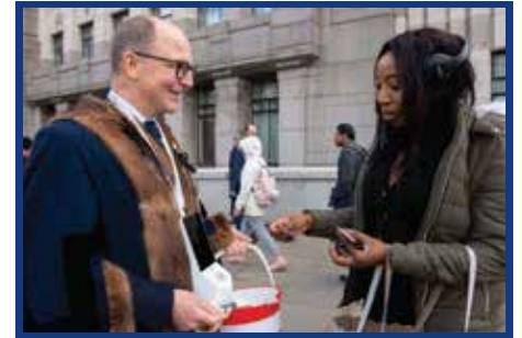
The Master in action